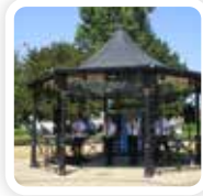
Hinckley & Bosworth Borough Council

Take it from the Top, a ten-piece band performing a lively programme featuring music from the 1940's, swing and pop classics all live in Argents Mead.