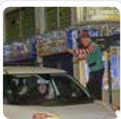
Hinckley & Bosworth Borough Council

Hinckley & Bosworth Borough Council and the United Reformed Church invite local disabled and elderly residents to come into Hinckley to see the Christmas lights. Upper Castle Street will be opened to traffic from 6pm to 8pm. Anyone is welcome to come and drive at your leisure to view the Christmas lights and then exit onto Regent Street.