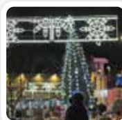
Hinckley & Bosworth Borough Council

Starting at 4pm on Friday with live entertainment in the Market Place, a range of market stalls and street entertainment followed by the lights switch on at 6.30pm. The Tin Hat Fair will be on Regent Street on Friday 4pm - 10pm and continues on Saturday 12noon to 10pm.