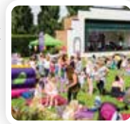
Hinckley & Bosworth Borough Council

Come and celebrate 50 years of Hinckley & Bosworth Borough Council with a day of family fun, live music and food stalls.