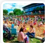
Hinckley & Bosworth Borough Council

Three fun filled days of activities for all the family; Mon: Flower Power, Tues: Go for Gold, Wed: National Play Day, the giant sandpit (part-sponsored by Hinckley BID) will also be back along with fun Snappy discos!